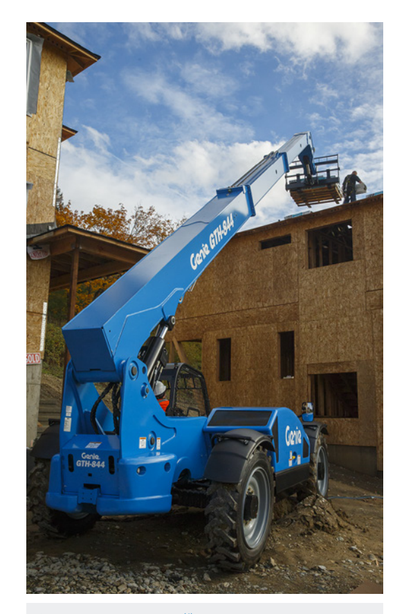
Long Life Tires