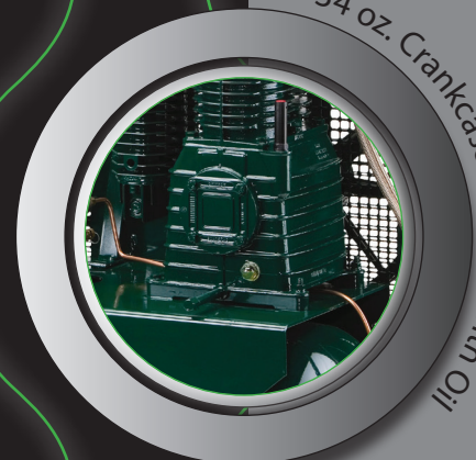
34 oz. Crankcase Prefilled with Oil