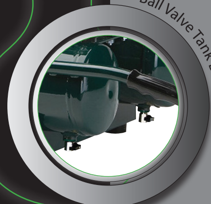
Ball Valve Tank Drains